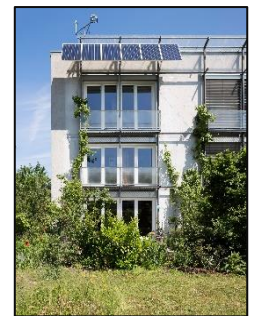
In 2021, the world's first Passive House building in Darmstadt celebrated its 30 th anniversary!

Passive House and renewable energy: The Passive House standard and generation of renewable energy directly on-site or near the building is an excellent combination. The Passive House Institute has also introduced the building classes Passive House Plus and Passive House Premium . The pioneer project in Darmstadt was equipped with a photovoltaic system in 2015 and therefore received the Passive House Plus certificate.