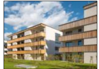
Socially compatible and highly energy efficient apartment blocks built to the Passive House standard.

Passive House buildings: With the Passive House concept, the heat loss that typically takes place in buildings through the walls, windows and roof is drastically reduced. By applying the following five basic principles 1. Excellent thermal insulation, 2. Windows with triple glazing, 3. A ventilation system with heat recovery, 4. Avoidance of thermal bridges, 5. An airtight building envelope, a Passive House building needs very little energy for heating and cooling. A major part of its heating demand is met through "passive" sources such as solar radiation or the heat emitted by occupants and technical appliances. The Passive House concept works well also in deep retrofits. The Passive House Institute has developed the EnerPHit standard for this purpose.